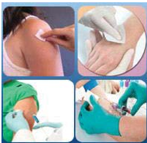
Figure 2: Alcohol swabs.