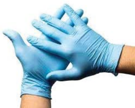
Figure 5: Disposable gloves.

cross contamination disposable gloves should only be used to treat one causality, they should be removed as soon as the treatment is completed.