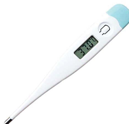
Figure 6: Digital thermometer.

Triangular bandages: A triangular bandage is made from a strong type of cloth which has been cut into a right-angle triangle. A triangular bandage can be folded in the shape of a rectangle. It can