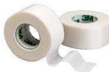
Figure 4: Medical tape.