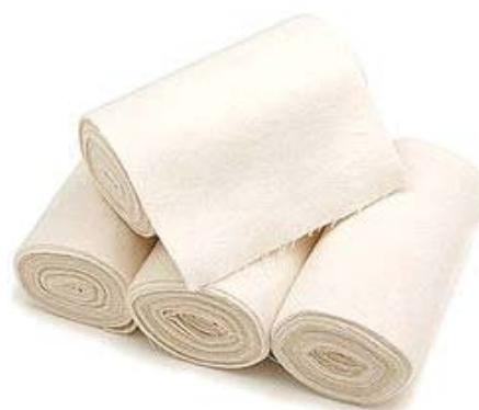
Figure 3: Adhesive bandages.