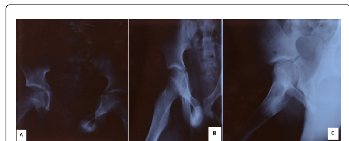
Figure 1: (A) X-ray pelvis of the face (B) Left frontal hip (C) Left ducroquet profile

The patient was initially treated symptomatically, but because of the recrudescence of purpuric rashes and the non-regression of abdominal pain, a systemic corticosteroid treatment at the dose of 1 mg/kg/day was prescribed with a rapidly favorable evolution.