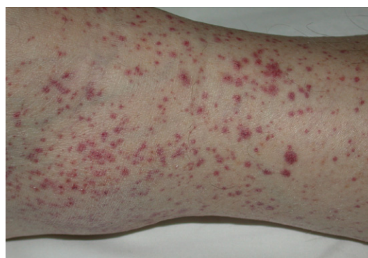
Figure 4: Purpuric rash of the lower left limb.