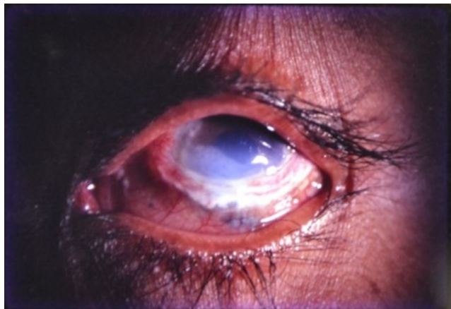
Figure 3: Left eye showing less corneal haziness and well taken up conjunctival graft.