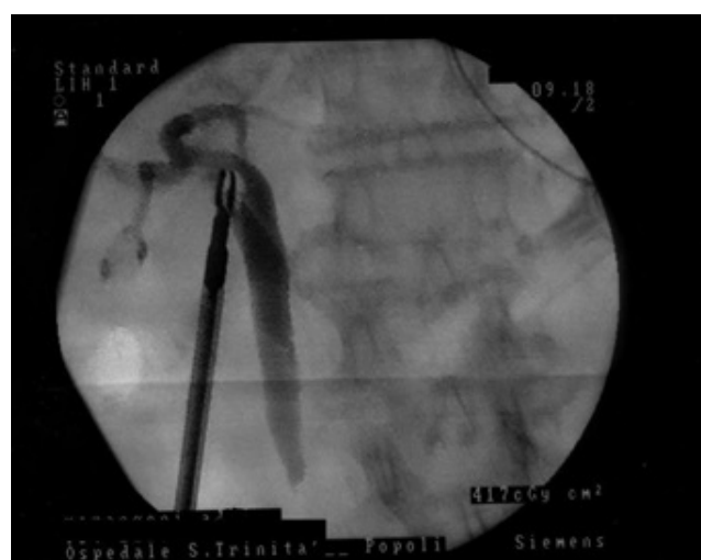
Figure 3: Anomalie disappeared after the IOC.

In 2 cases prothesis were applied due to an unsatisfactory clearance of bile ducts. We observed post-treatment pancreatitis in one case during the same hospitalization. The event occurred in the 8th postoperative day. Residual bile duct lithiasis was found and solved by a second ERCP.