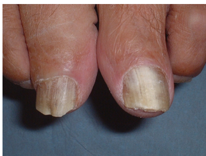
Figure 1: Lack of nail shine in a 67-year-old patient who was suspected to have onychomycosis. No fungal elements could be shown.

Brittle and fragile nails are common in females, and the frequency of this condition increases with wet work and age. Nails may also be felt to be too soft or too hard. There is a plethora of different remedies offered in drugstores for the treatment of brittle nails, but the most important fact is to know the commonest cause, repeated maceration and dehydration. This is probably the reason why women complain 10