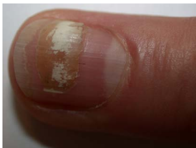
Figure 11: Transverse leukonychia due to a crush injury in a 62-year-old man.

Biotin is often called the “hair and nail vitamin”. It was shown to improve the quality of horse hoofs, but there are very few sound studies in humans. The author’s own experience is very variable with some patients coming back with enthusiastic report of almost miraculous improvement of their nail quality within a very short time, but most taking the drug for months and years without apparent beneficial effect. One problem is the dose as it is not known whether the treatment is a substitution of the vitamin or if we need pharmacological doses [5].