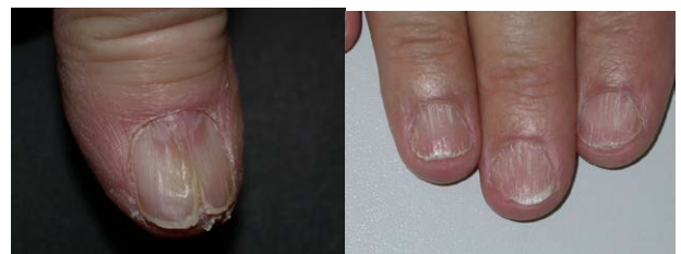
Figure 2: 2a. Severe onychorrhexis (longitudinal splitting) of the nail in an elderly woman. 2b. Ridging and surface splits in the nails of a 62-year-old man.