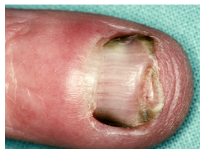
Figure 4: Greenish-black discoloration of the lateral margins of the nail in a 64-year-old housewife.

Silver nitrate causes jet-black stains. Orange-brown nails were observed in Kawasaki syndrome and light red nails in Serratia marcescens infection. White color may occur as spots, lines or be