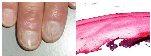
Figure 3: 3a. Lamellar splitting of the right ringfinger nail. 3b. The histological picture shows a split formation in the superficial nail plate layer.

times more often to have brittle nails than men; however, male chefs, other kitchen workers, butchers, fish-mongers etc. suffer less frequently from fragile nails than women with the same profession.