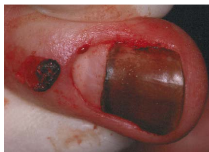
Figure 6: Diffuse brown stain of the nail plate due to povidone-iodine.