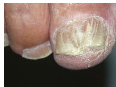
Figure 5: Thick yellowish nails of an 85-year-old man with onychomycosis.