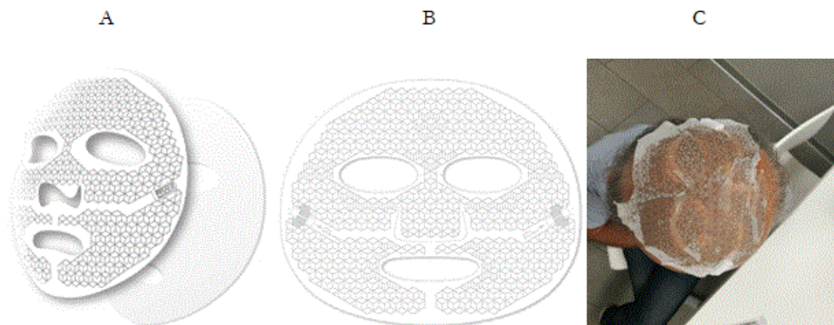
Figure 1: The Dual Mask Enhancer System (A: the two layers; B: the external layer; C: use of the mask on scalp).

ALA is, in fact, a metabolite of heme biosynthesis [3,4]. Intracellularly, it is converted to PpIX. In most cases, 5-ALA is applied in creams, emulsions or ointments at a concentration of 10–20%. A new formulation of ALA at “low” concentration (5%) in a thermosetting gel is available for C-PDT or DL-PDT (ALAFast; Cantabria Labs Difa Cooper). This formulation, thanks to its high content in water, could be feasible for application with penetration-empowering dual mask which could optimize and speed-up the penetration of the active compound through the skin. This mask device (Franz Infusion Dual Mask System) comes in two layers [5]. The first layer is wet and in contact with the applied gel. The second layer, which is dry and overlaid on the first, allows the key ingredients to penetrate the stratum-corneum utilizing a micro-current circuit using two anodes placed on each side of the mask acting as natural batteries. The mask is designed for the face but it could be used also for the bald scalp also (Figure 1). This mask could reduce the incubation time of the photosensitizer needed to allow adequate skin penetration before the PDT procedure [6].