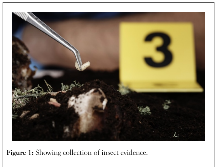
Figure 1: Showing collection of insect evidence.

years. In 1996, some of us established the American Board of Forensic Entomology, a forensic entomologist's certification program, similar to the board certification offered to forensic dentists and forensic anthropologists.