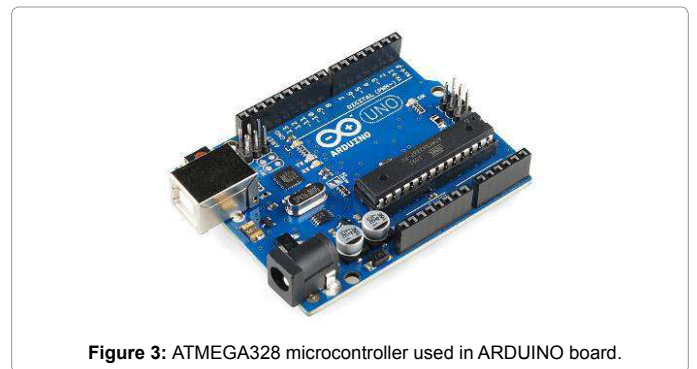
Figure 3: ATMEGA328 microcontroller used in ARDUINO board.