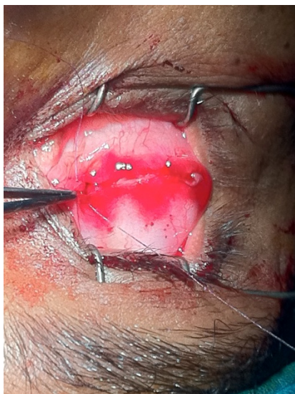
Figure 3: Closing of Tenon capsule and conjunctiva by 6/0 Vicryl sutures.