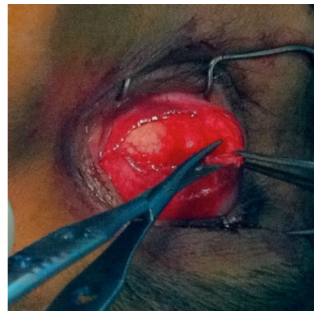
Figure 1: Scleral tissue excision from implant.

the implant; the scleral shell, free scleral graft sutured over the main suture line thus acting like a shield protecting the main wound. The tenon capsule and finally the conjunctiva follow this.