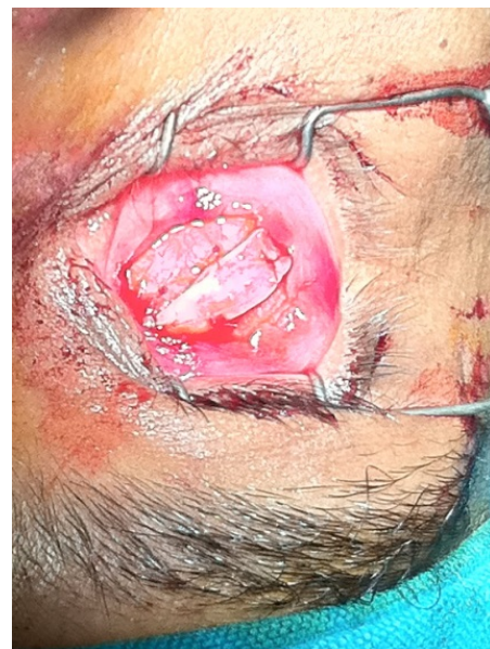
Figure 2: Graft placement and fixation over the suture line.