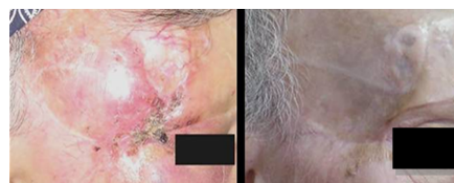
Before treatment After treatment

Figure 3: Patient (M, 77 years old) with BCC in medial canthus, with CR after HeberPAG treatment.