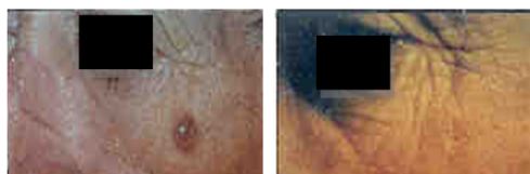
Before treatment After treatment

Figure 1: Patient (M, 65 years old) with nodular BCC treated with 3,5 MIU HeberPAG perilesional 3 time a week × 3 consecutive weeks with CR.