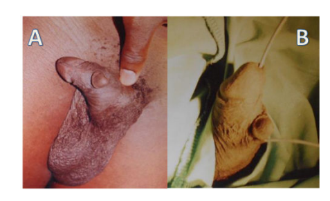
Figure 1: A - penile duplication, B- catheterization transuretral two urethral meats.

described three anatomical forms of diphallia: glandular penile, bifid and complete. It's reflecting the difficulty to find one classification to this malformation.