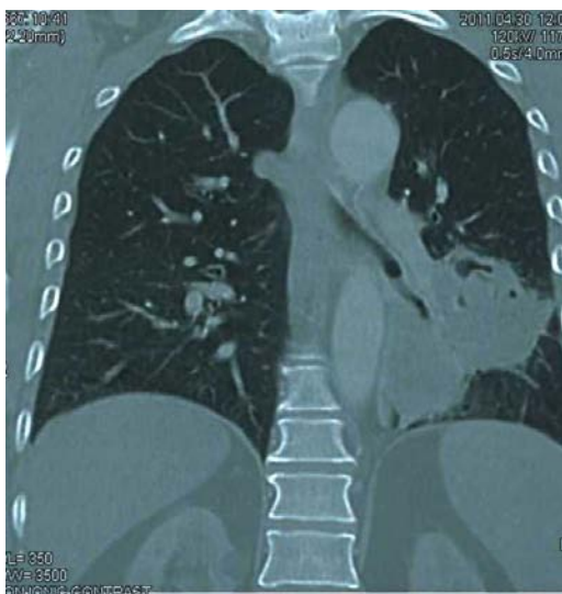
Figure 1: Large heterogeneous mass in left lobe with surrounding ground glass opacity (CT of thorax).

A 42 years old male was presented with irregular fever and hemoptysis for a duration of one month. He had a history of hydatid cyst of left lung for which he was operated one year back. CT (computed tomography) of thorax showed a large heterogeneous mass of 80 \times 73 \times 45 \text{ mm}^3 with air bronchogram and bronchiologram seen involving posterior-medial basal segment of left lower lobe and posterior segment of left upper lobe with surrounding ground glass opacity, speculation from surface and extension along major fissure with satellite nodule (figure 1). Radiologically the provisional diagnosis of carcinoma of lung (broncho-alveolar carcinoma) was made.