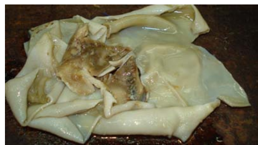
Figure 2: C/S of cystic structures containing brownish necrotic material.

Hydatid cyst (echinococcosis) is a parasitic disease which is most commonly caused by Echinococcus granulosus , but Echinococcus multilocularis is the most common type causing pulmonary infection.