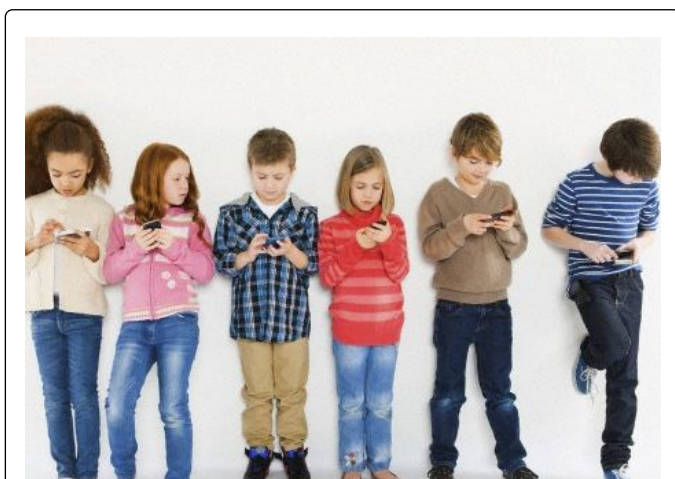
Figure 2: Mobile usage in teenagers.

Texting (IM) is a type of continuous direct content based correspondence (Chatting) through PCs or mobile phones with one or more people while associated with the Internet. It is a greatly quickly developing correspondence medium, particularly among young people [84-95]. Young people use IM on a successive premise frequently utilizes awful linguistic use, poor accentuation, and dishonourable truncations which influences their scholarly written work [96-98] (Figure 2).