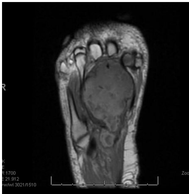
Figure 6: MRI axial view right foot.

conventional schwannomas. The gray-brown pigment occasionally seen in conventional schwannoma represents lipofuscin opposed to true melanin [1]. Although nerve roots and the paraspinal sympathetic chain are the most frequent locations of melanotic schwannomas, they may present at various anatomic locations [1,2]. However, their presence in the foot is extremely rare with very few cases published in the literature. The appearance of this tumor on clinical exam and