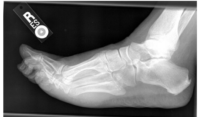
Figure 3: X-ray lateral view right foot.