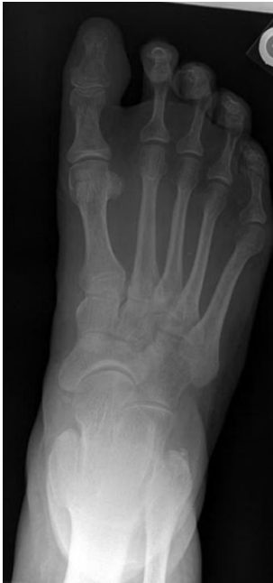
Figure 1: X-ray DP view right foot.