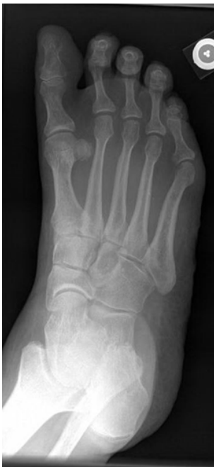
Figure 2: X-ray oblique view right foot.