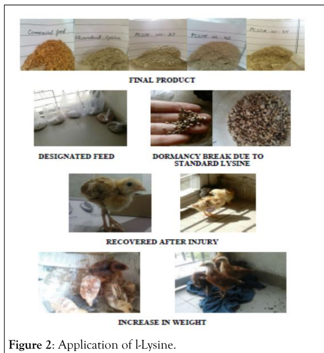
Figure 2: Application of l-Lysine.

product was filtered and calculated the respective amount of lysine benevolence. For the production of feed, vigorous expanse of L-lysine produced in a culture broth was purloined and then jumbled with the plant material i.e. Pennisetum glaucum (L.)R. Br [17-22]. This intermingled material was daubed together for 2 days till the seeds of the plant utterly engross the product. When the seeds are absolutely soaked in the product, it was spread on a piece of newspaper and consigned in open air for drying. After 2 days the experimental feed was ready for trial usage (Figure 2).