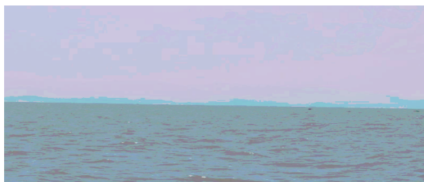
Figure 2: Current view Lake Tana.