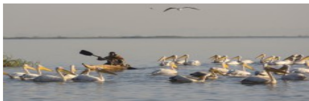
Figure 1: Ecological view of Lake Tana.