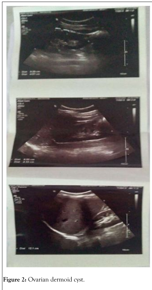
Figure 2: Ovarian dermoid cyst.