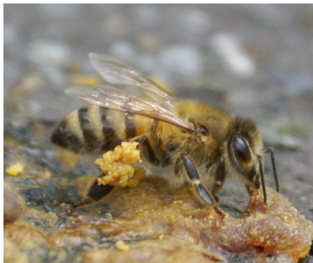
Figure 2: Bee collecting resinous substances of plant origin.

Hence, it has wide application in medicine, veterinary medicine and livestock rearing.